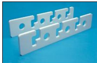
Fishing Pole Holder