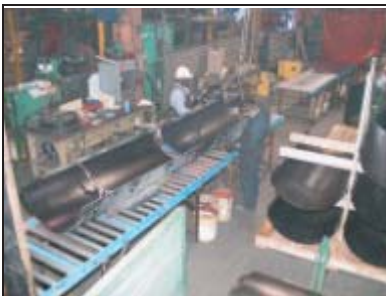
Heat formed UHMW for linear transfer applications