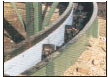
UHMW acts as a wear resistant chain guide at sawmills