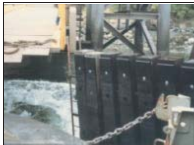
UHMW for impact fender systems in marine environments